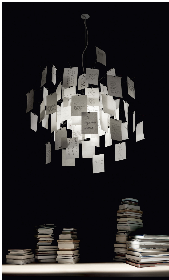
Zettel'z 5 INGO MAURER 1997

Stainless steel, heat-resistant satin-frosted glass, Japanese paper. 31 printed and 49 blank paper sheets DIN A5. The Zettel'z 5 is one of Ingo Maurer's best known lamps. It gives the user plenty of room for his or her own creativity, and can be set up so that it is space-consuming and loose or narrow and dense. The blank sheets of paper supplied with it are designed to be used for your own messages or sketches. The Japanese paper is very thin and translucent. Two bulbs provide good light.