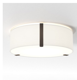
CODE: 1463001 FINISH: WHITE FABRIC