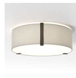
CODE: 1463003 FINISH: PUTTY FABRIC

TO MAINTAIN THIS PRODUCT TO ITS BEST CONDITION, PLEASE VIEW OUR CARE AND CLEANING GUIDE ON THE SUPPORT SECTION OF THE ASTRO WEBSITE.